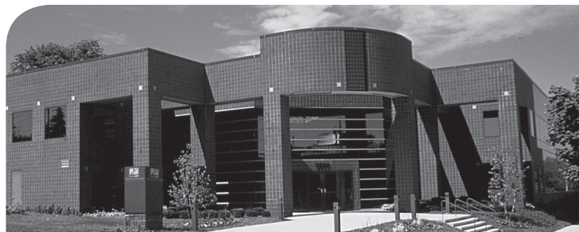
Hal Leonard – Milwaukee, WI

In 1939, the first choral arrangement became available. Later, Mr. Waring changed the name of the company to Shawnee Press and moved the headquarters to Pennsylvania—an obvious site and name since his home was located in nearby Shawnee-on-Delaware.